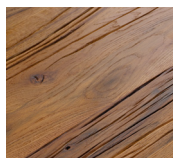
ROVERE MORDENZATO NOCE STAINED WALNUT