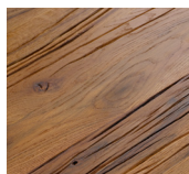
ROVERE MORDENZATO NOCE STAINED WALNUT